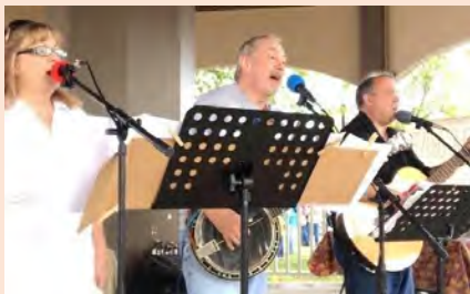
BANJOVI & HAWKINS

JULY 30, 2023 Rotary Shelter 815 Lincoln St 6-8 pm Sponsored by Washington Presbyterian Church